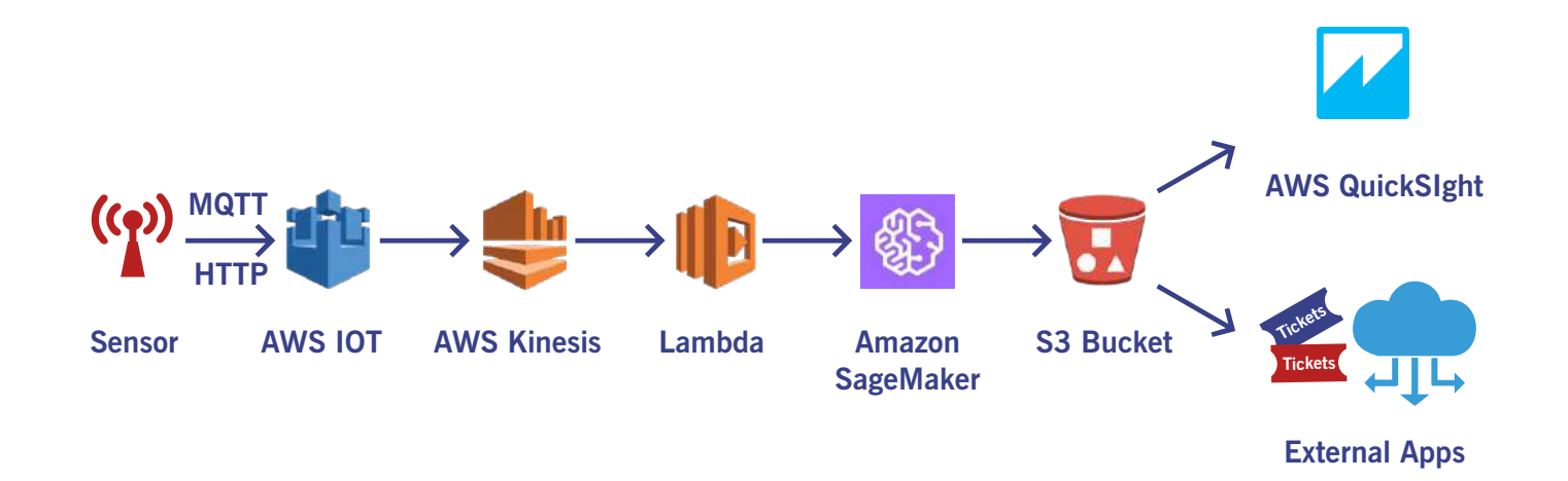
Figure 2. A typical anomaly detection workflow with Amazon SageMaker